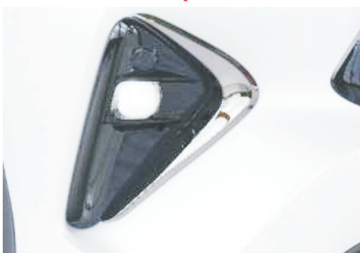
Fog Lamp Garnish