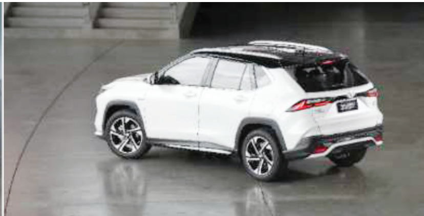
The Yaris Cross SE is designed to stand out on city streets and open highways, featuring: