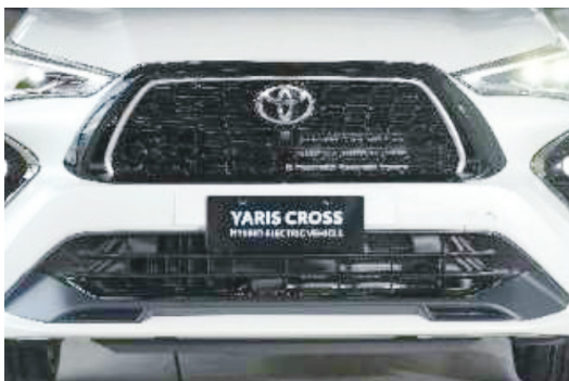
Front bumper and Grille Garnish